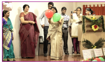
Games at the Teachers Day